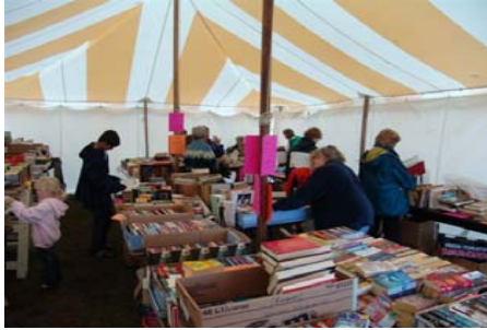
LIBRARY COMMITTEE BOOK SALE