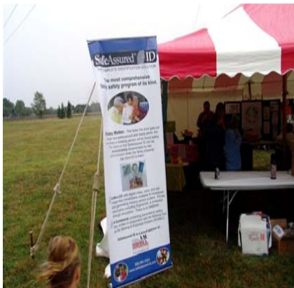
SAFE ASSURED ID