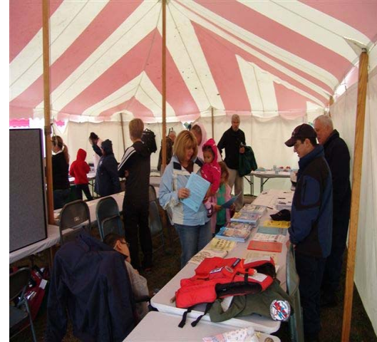
AGENCIES AND ORGANIZATIONS

Our sincerest apology if we missed someone in error.